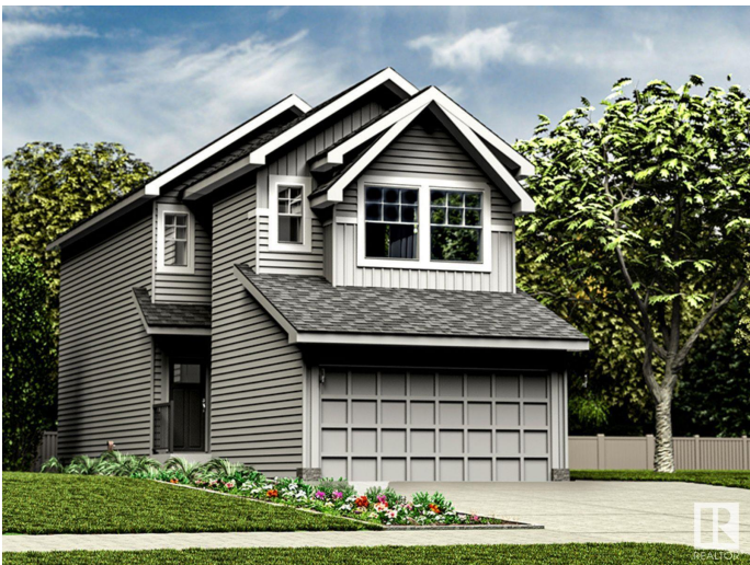
The Archer 20 | 1,585 Sq. Ft.