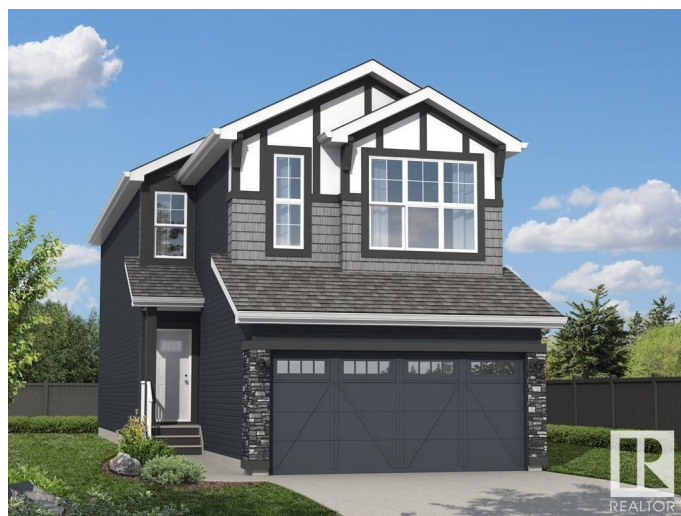
MAIN FLOOR 902 Sq. Ft. | 9 Ft. ceiling