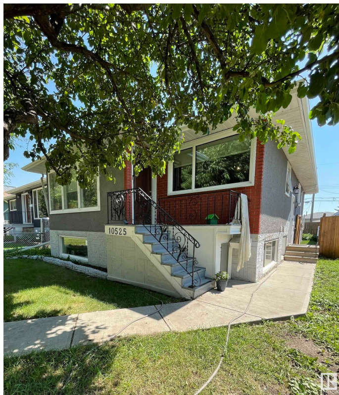
10525 63 Ave, Edmonton